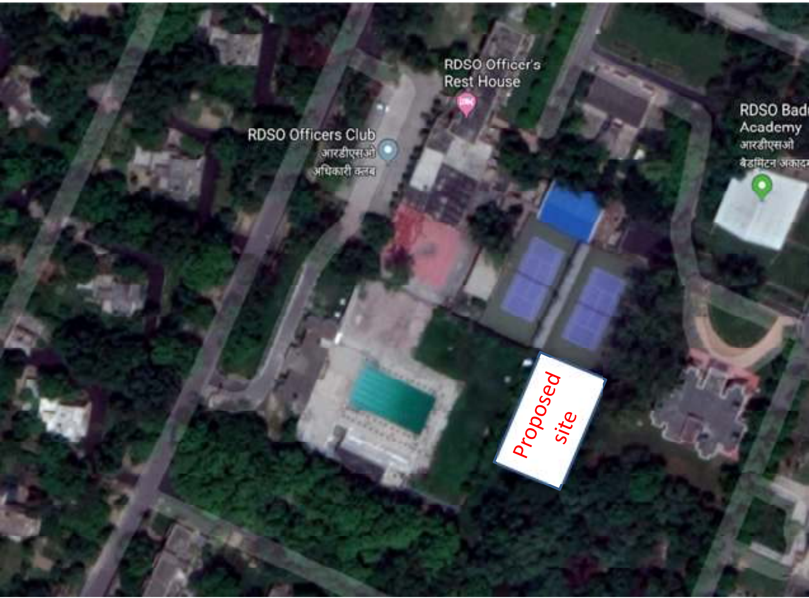
Figure 1 Proposed Site location